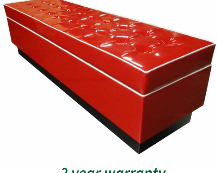
2 year warranty